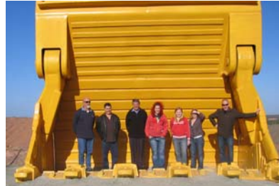
(Pictured Above: MWAC Officers at Superpit in Kalgoorlie)

On Monday 14 May 2007 Municipal Waste Advisory Council (MWAC) Officers held a non-metropolitan workshop at the City of Kalgoorlie-Boulder.