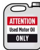
For disposal options www.wastenet.net.au

These magnets will be available to local