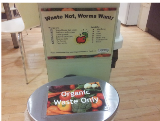
Figure 13: Clearly labelled dedicated food waste bin in office lunch room.

Food manufacturers, which can generate substantial quantities of food waste, may also opt for a food dehydrating system to minimise the volume and weight of waste, thereby reducing storage space requirements. Food dehydrators can reduce weight by up to ninety percent, substantially reducing collection and disposal costs. The dehydrated, compressed waste, which resembles dry soil, is inert, odourless and can be applied directly to soil as a conditioner and fertilizer or re-wet and composted. Dehydrators operate at high temperatures, eliminating bacteria.