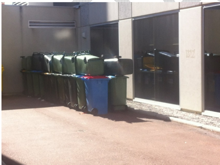
Figure 3: Inappropriate and unsafe storage MGBs.