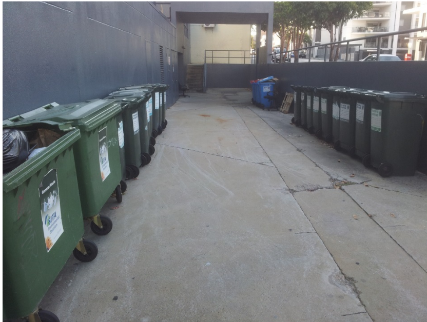
Figure 5- Appropriate storage of bins.

boards, gas meters or conduits, should not be located in bin storage areas as they may be damaged during collection or cleaning.