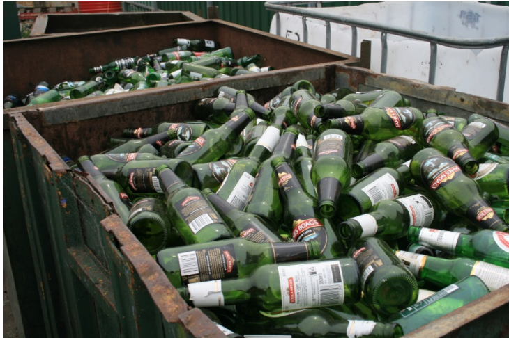
Figure 9: Large quantities of glass bottles are generated by pubs and clubs.