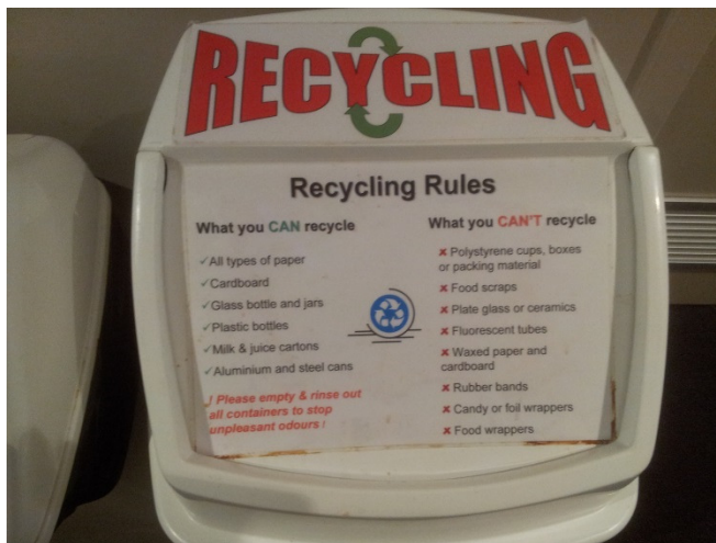
Figure 8: Comingled recycling collection bin outside office kitchenette.

Recyclable items should be placed loose into bins to ensure that it can be properly sorted at material recovery facilities. Some Local Governments may be able to provide this service for an agreed fee. Alternatively, private waste contractors may be engaged to provide the required bins and collection service. Operators should ascertain what recyclable materials are likely to be generated within their development, and identify a suitable waste contractor who can collect this material.