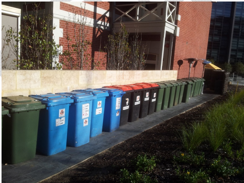
Figure 4: These bins are easily accessible, but highly visible from the roadway. A bin store would help to minimise their impact on local amenity.

Bin storage areas should not affect the aesthetics of a development and should blend in with the surrounding buildings and landscape (Figure 4). Aside from aesthetics, locating storage areas out of sight of the public can reduce the chance of vandalism (as bins are less accessible) and reduce the impact of noise and odour.