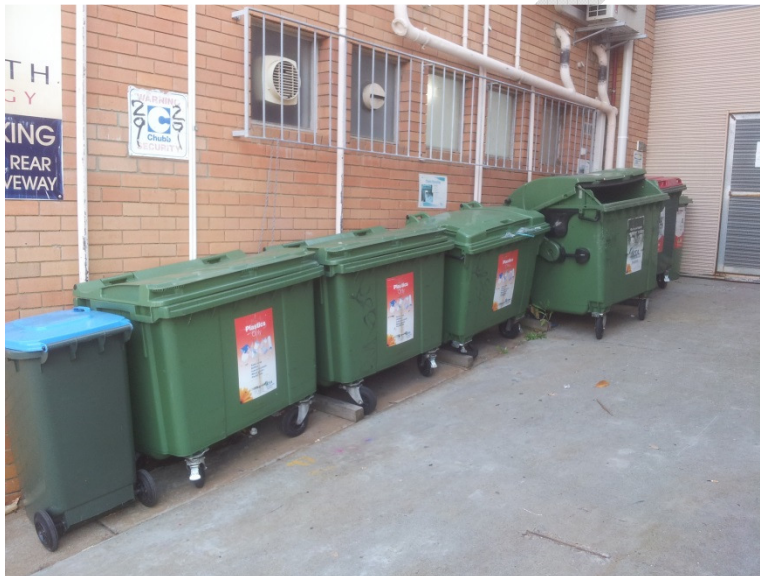
Figure 7- Inappropriate and unsafe storage of plastics recycling bins along a steeply inclined loading bay.

Waste service companies may charge a greater collection fee if drivers are required to enter a bin store to service bins.