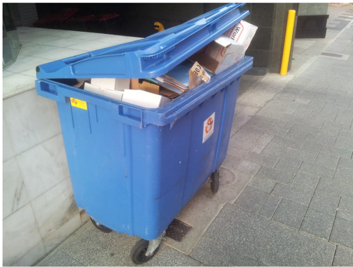
Figure 11: Dedicated 660L MGB for cardboard recycling presented for collection.

Typically, bins for general waste and separate bins for paper/cardboard and co-mingled recyclables are used for the disposal of bulk packaging. Where large volumes of packaging materials are generated balers and compactors can be installed to reduce the volume. Front-lift bins with wire panels that allow contamination checks are used widely for cardboard. Tenants and cleaners should flatten cardboard boxes as much as possible to save space in bins. Cardboard is generally very bulky but comparatively light weight and compacts well. Compactors and balers are ideal for cardboard for transport. One problem with cardboard from food retail buildings is that it can be contaminated with food and liquids. This makes it unsuitable for recycling. However, this contaminated cardboard is suitable for composting alongside food waste. Figure 11 and 12 show different types of cardboard/paper collection.