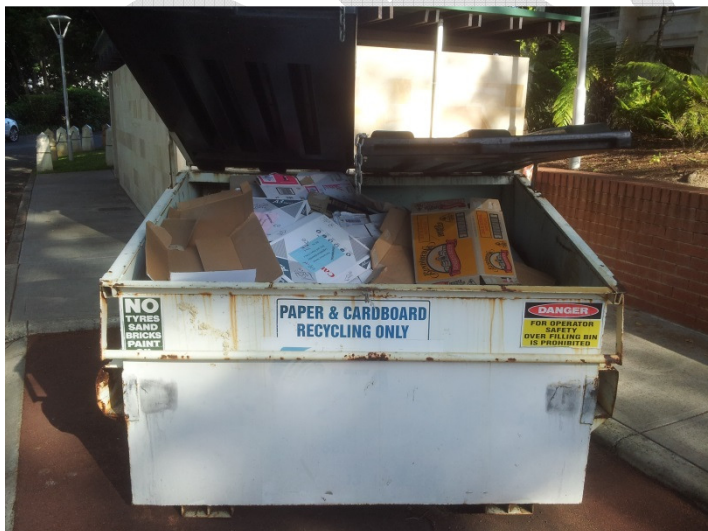
Figure 12: Commercial service providing a skip bin for the collection of large volumes of cardboard packaging.