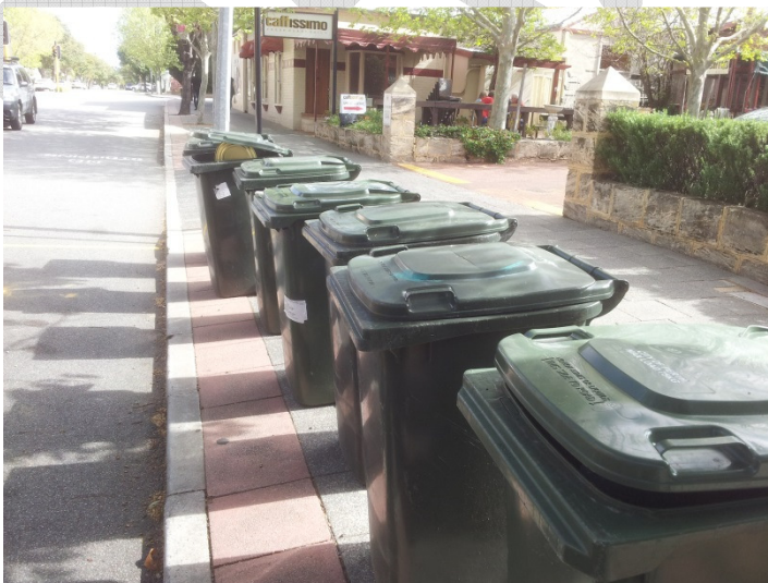
Figure 6: 240L MGBs for general waste presented for collection.

All collections should take place in accordance with all relevant legislation. If the storage area and presentation point are in separate locations, bins will have to be moved by staff or