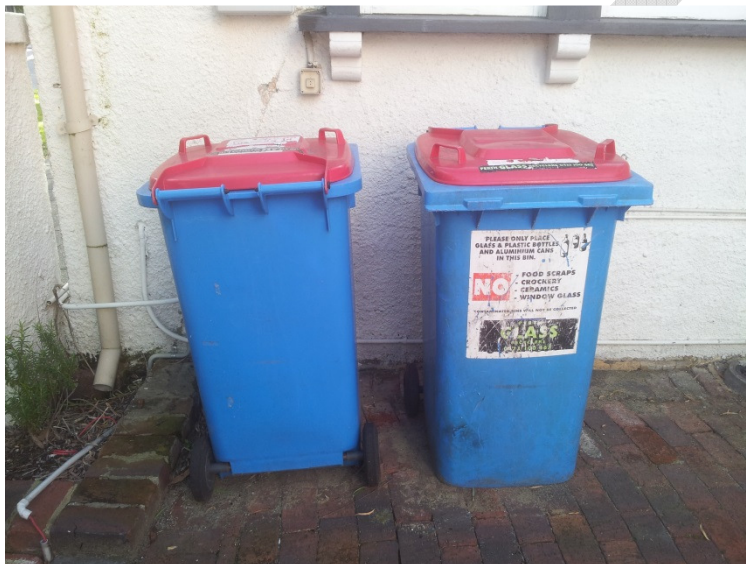
Figure 10: Commercial comingled recycling bins employed by a cafe.