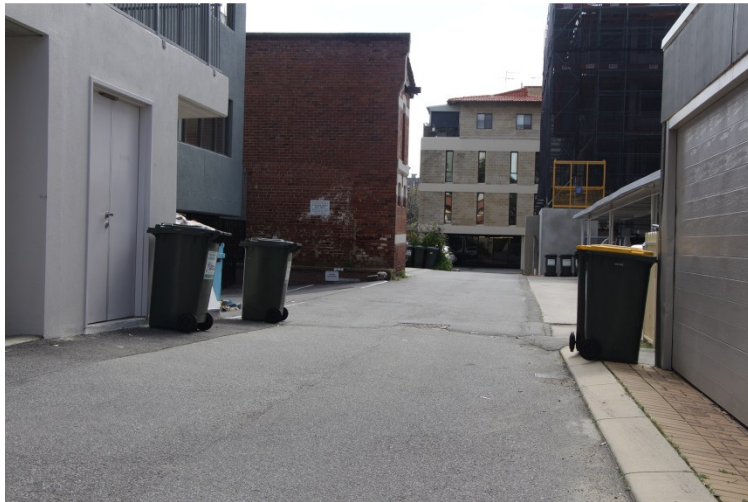
Figure 2: Haphazard storage of commercial bins within a rear laneway.

How the bin storage will be serviced is an essential consideration. Bins may be taken and emptied directly from the bin store area, or transported to a separate presentation point where they will be emptied by the service provider. If the storage is located away from the collection point, a responsible individual will be needed to transport separated waste from individual tenancies or areas.